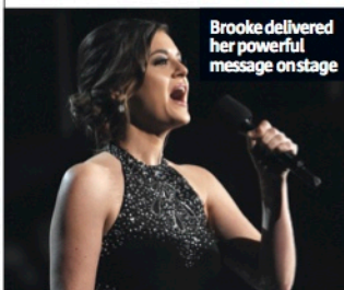
Brooke delivered her powerful message on stage

■ If you're experiencing domestic abuse, or are worried about someone who is, call The National Domestic Violence Helpline on 0808 2000 247.