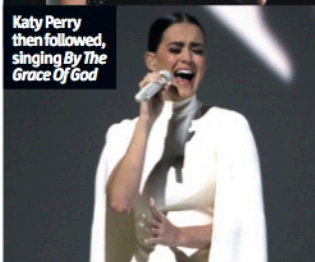
Katy Perry then followed, singing By The Grace Of God